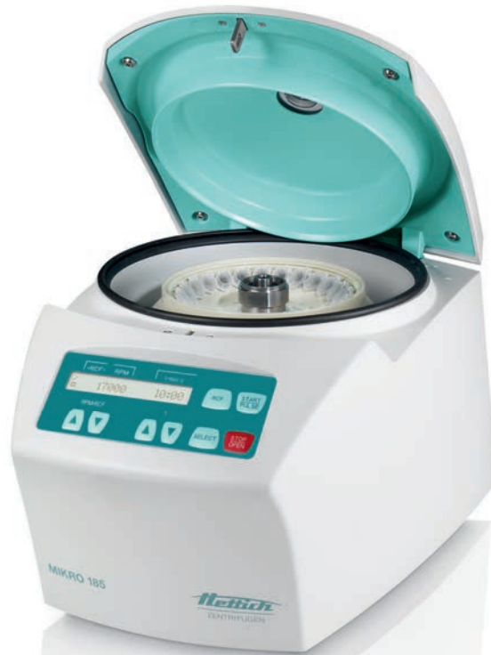
MIKRO 185 Microlitre centrifuge

Its compact dimensions mean that the MIKRO 185 takes up little space on the workbench.