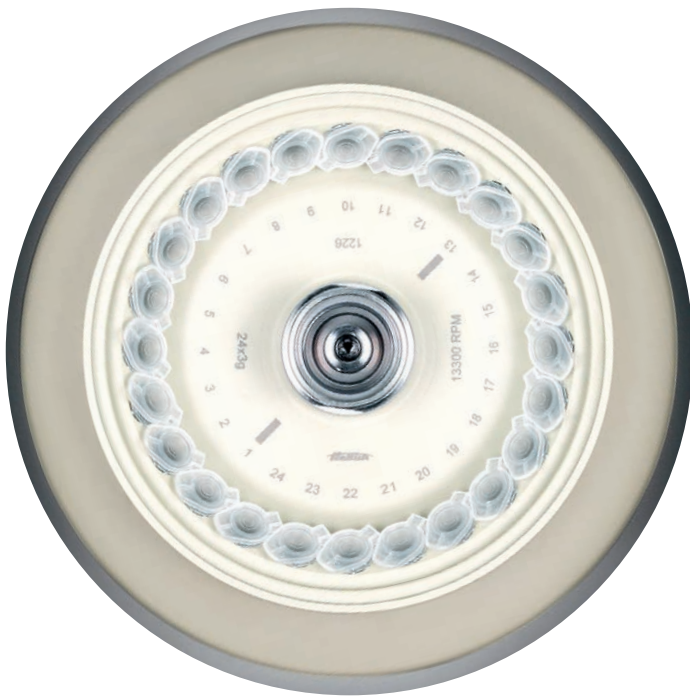
View into the centrifuging chamber showing the rotor 1226